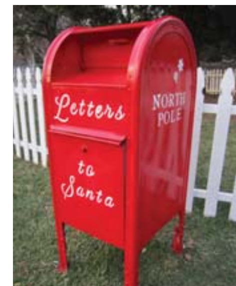
Letters to Santa Mailbox stands ready to transport correspondence to the North Pole.

Santa expects to hear from 250 Lamorinda children this year, and he wants to remind everyone that the deadline to mail a letter to Santa is Dec. 17. At the stroke of 5 p.m., his most trusted elves will come out of hiding and whisk the mailbox back to the North Pole. Ho-Ho-Ho!!!