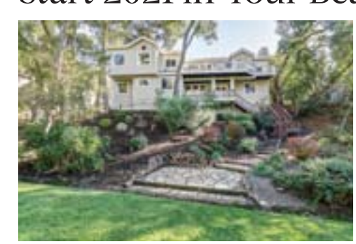
31 Merrill Circle South, Moraga 4bd/3.5ba | 4,331 sq.ft. | .93 acres $1,900,000